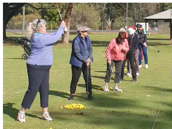
Coaching clinic for seniors at Pinjarra GC