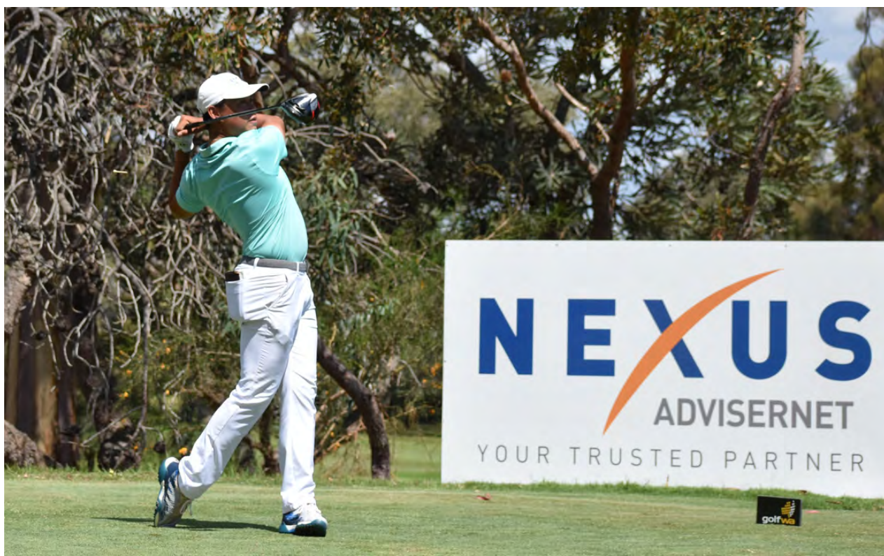
The WA Open was substantially televised for the first time in October 2022

Whilst this is clearly not a sustainable practice, the Board did make the decision to televise the event only several months out and believe that this TV coverage will benefit the promotion of the game in WA and we are also confident that it will generate greater sponsorship for 2023.