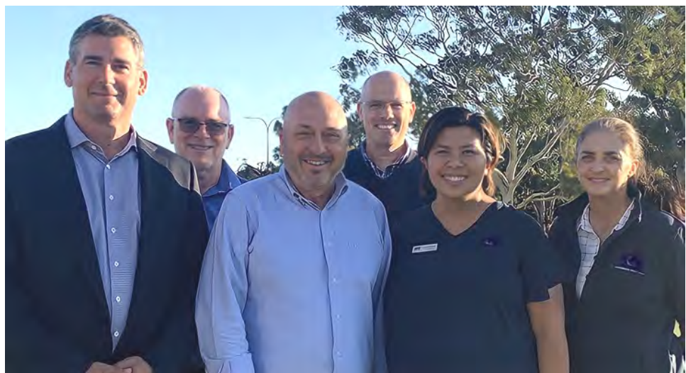
Board members at Gosnells Golf Club, which became the first WA signatory to the R&A's Women in Golf Charter

One of the key components arising out of the National Strategy is the Women's and Girls Engagement Strategy, which is the evolution of Vision 2025. Part of that strategy is the R&A's Women in Golf Charter and I am delighted to advise that Gosnells Golf Club became the first WA signatory to this charter in late 2022. Another dozen clubs have expressed their desire to become signatories and I anticipate that many of these will come to fruition in early 2023. ►