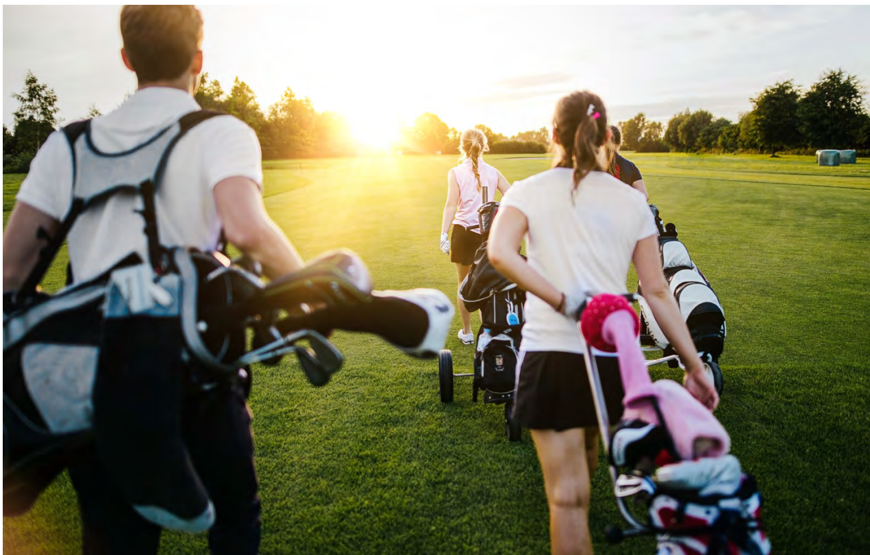
Participation rates remain well above pre-COVID levels