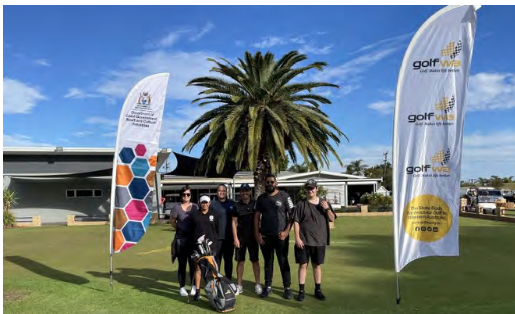
Training session for Community Instructors in Geraldton, July 2022

The RSG grant has been renewed and we look forward to growing our key pillars in our regions further and using 2022 as a benchmark for 2023. ►