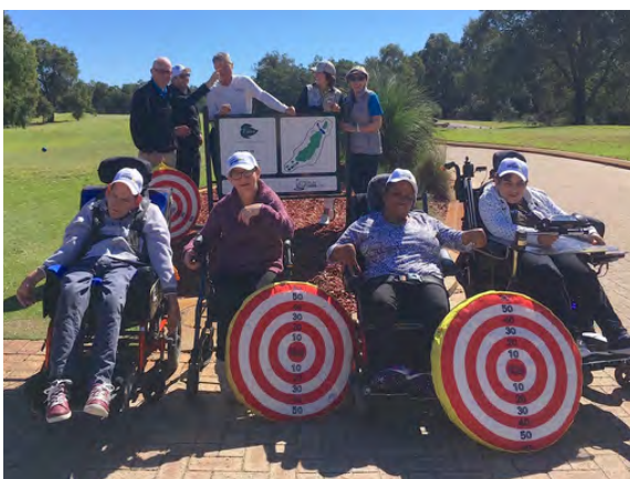
Participants in The Vines' Ready Steady Golf program for those with disabilities

The Trustees would also like to thank the WA PGA office who held a Charity Day in November with just under $10K being raised and going to the WA Golf Foundation.